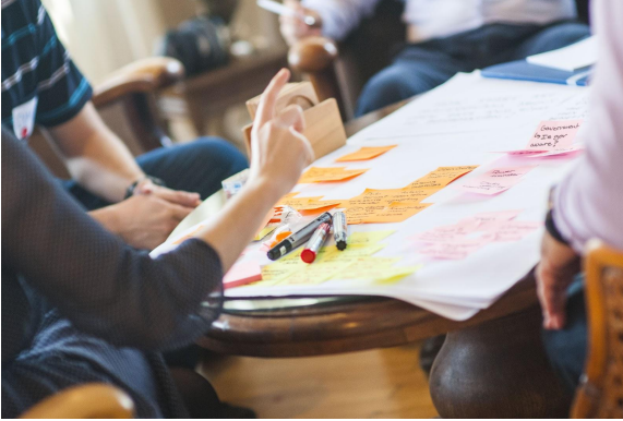
Workshop discussing the challenges that Macedonian CSOs, media and citizens face when working with open data.